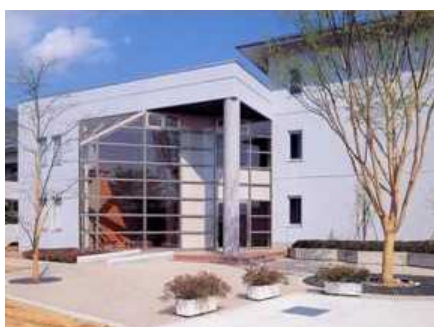
International Students' House (in Kofu City)

*Note that the above rates do not include utility fees.