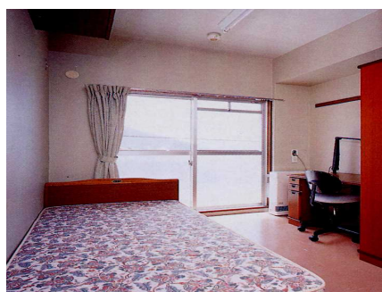
Inside of the room (Kofu City)