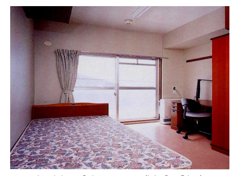
Inside of the room (Kofu City)