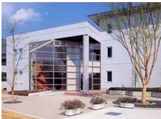
Kofu International Residence Hall (Kofu City)

*Above fees do not include utility fees, room cleaning fee, and rental bedding fee.