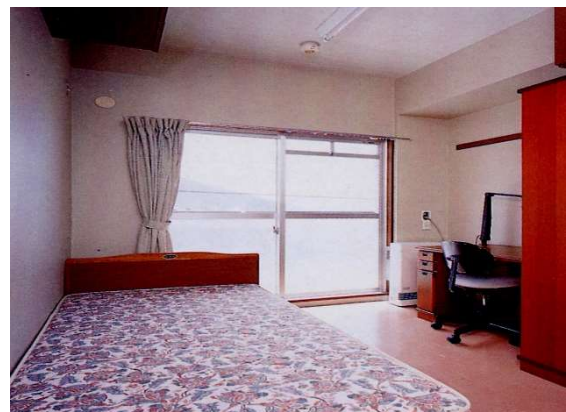
Inside of the room (Kofu City)